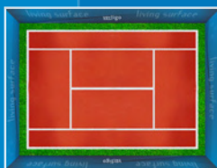
interactive sports - tennis

Click here to see the film on the classic TV game ›Pong‹