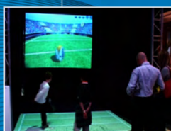
Click here to see the film on the ›living-surface rugby game‹