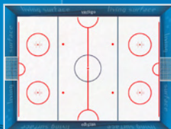
interactive sports - hockey